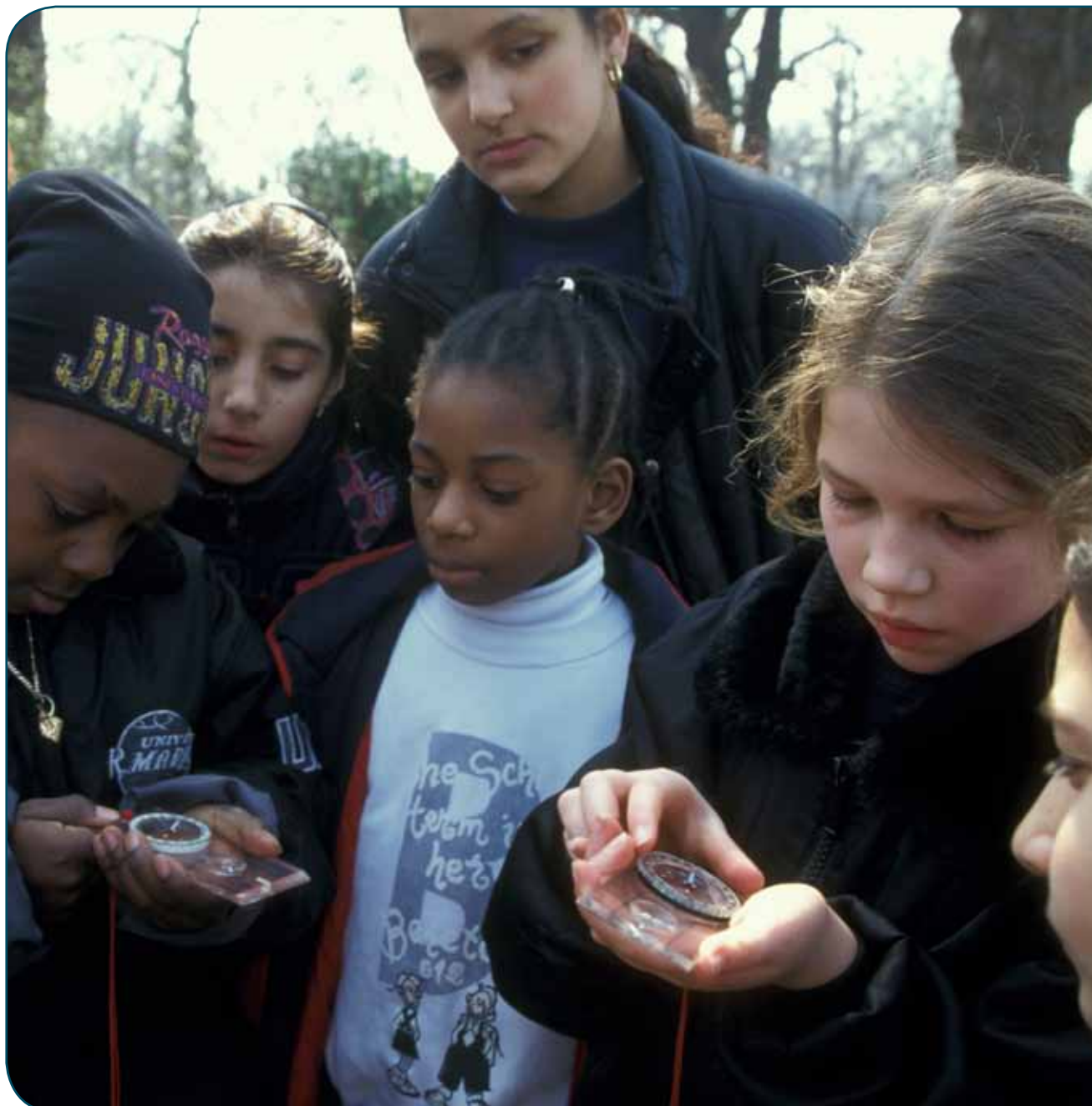
Children and young people